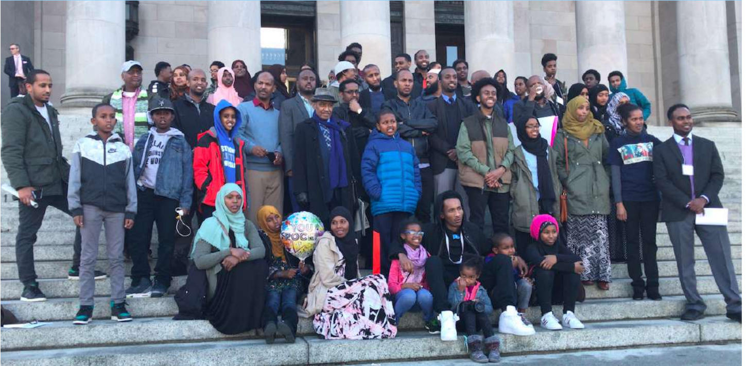
1st East African Lobby Day in Olympia, at the steps of the Capitol building.

Through Seattle Foundation's funded project, the East African Political Awakening Project took off in 2017 in partnership with three other East African community led organizations; Companion Athletics, CARE Center and ADWA. The coalition joined unified collective approach in civic engagement, policy and systems advocacy work, with an ultimate goal developing community's leadership skills and organizing for collective courses.